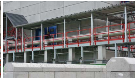
U420 outloading conveyor