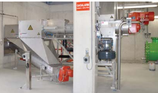
2x SPIROPRESS ® 315 (customized) & 2x receiving U420 conveyors