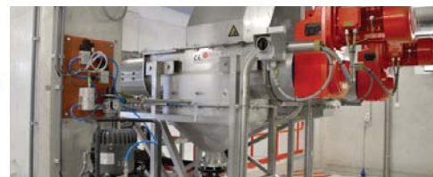
Compressor with valves to control the pneumatic cylinders