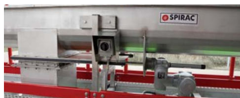
Auma controlled slide gate