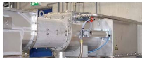
SP315 customized Presshead