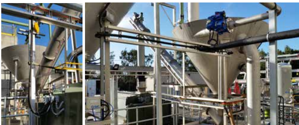
SANDWASH™ and SPIROTAINER®: Grit washing and storing

SANDWASH™ our grit washer and SPIROTAINER® our disposal unit was combined to treat and store the grit provided by a vortex grit cyclone. Two SANDWASH™ units make sure that the grit is cleaned prior to being deposited into SPIROTAINERS®. The washed and classified grit is directed to SPIROTAINERS® for disposal off site. SPIROTAINERS® have a nominal capacity of 10 m 3 and two bins have been provided with weight cells for the grit treatment area.