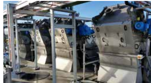
Traveling Fine Screens

SPIRAC was asked to update the pretreatment area for the Glenelg WWTP. To handle up to 2100 L/sec four traveling fine screens were installed. The screens work in an on and off-line configuration to prevent grit settlement upstream of the screens.