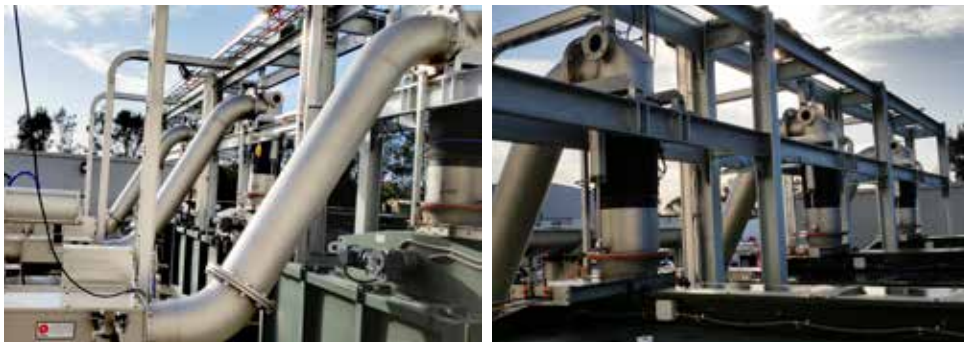
SPIROWASH® and SPIROTAINER®: Screenings washing and storing

The screenings get transferred from the screens via launder system to three SPIROWASH® units our screenings treatment units. The SPIROWASH® units wash out the organic material, reduce the volume and weight of the screenings and compacts them. SPIROWASH® pushes the screenings through a press tube and drops the material into SPIROTAINERS®. The screenings handling system is able to continue to handle the maximum screenings loading should a SPIROWASH® be out of service. SPIROTAINER® units are capable of containment and road transport and therefore are a durable and efficient solution for wastewater treatment and materials handling. Retractable chutes between the press tubes and the SPIROTAINER® units reduce the chances of spills and leaks. Given the proximity of the Glenelg WWTP to metropolitan areas, the entire system was designed to contain foul air.