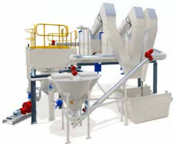
COMBIGUARD® Type2 including SPIROGUARD®, Grit Vortex and SANDWASH™