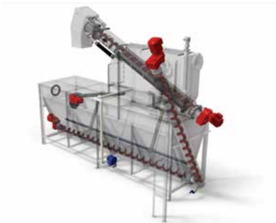
COMBIGUARD® Type 1 including press head

COMBIGUARD® is your solution when you need to create a complete end-to-end wastewater pre-treatment plant, that covers all of the applications required for municipal facilities. When brought together with screenings washing, dewatering and flotation, a complete inlet works system can be created.